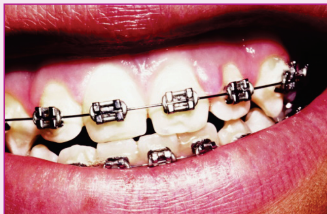
Metal wires and brackets